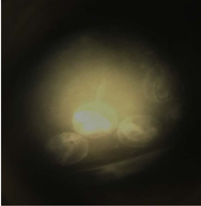
Figure 4: 0.1 mg/mL concentration- Dead, unhatched, curved spine, very little development.