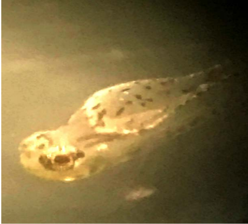
Figure 2: Control- Live, hatched, straight spine, blood flowing, swimming freely.