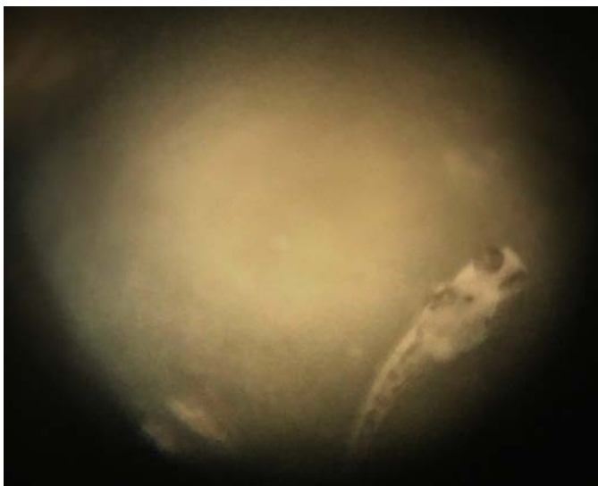
Figure 1: Concentration 0.12 mg/mL- dead, hatched, small curve of the spine.