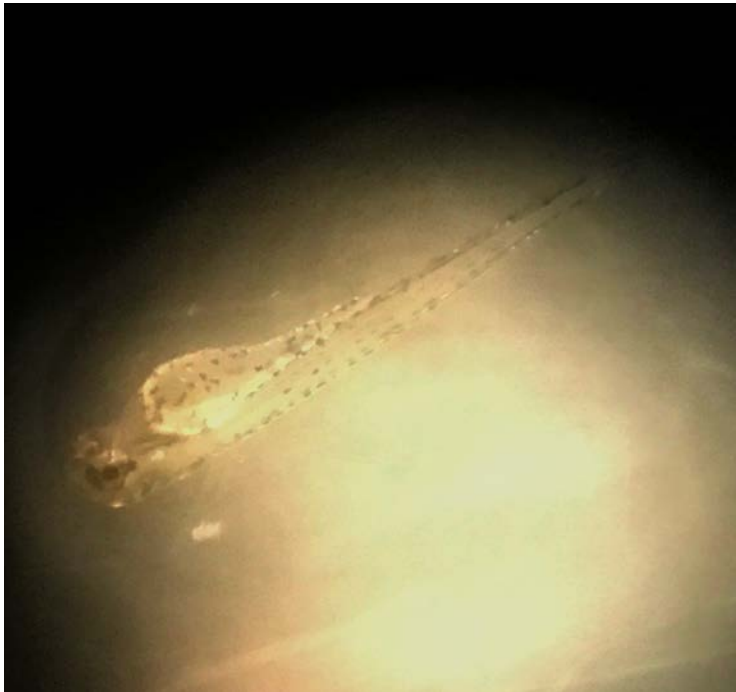
Figure 3: Control- Live, hatched, straight spine, blood flowing, swimming freely.