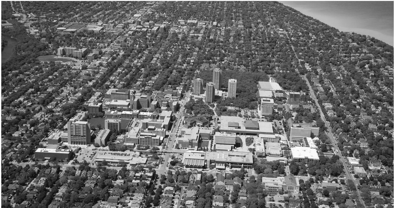
(Aerial photo looking south to north, ca. 2010)