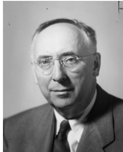
First Secretary-Treasurer & Newsletter Editor of UWM RFA (1962-1969)