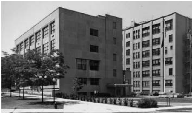
UWM Downtown Campus

The present College of Engineering & Applied Science is the result of over 110 years of programs offered by the University of Wisconsin Extension in Milwaukee. By 1923 a full two year curriculum was offered in Chemical, Civil, Electrical, Mechanical, and Metallurgical & Mining Engineering. Madison faculty taught the courses. In 1923 a new downtown campus was constructed to accommodate the increasing number of Milwaukee students.