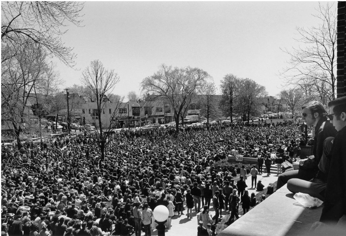
Mitchell Hall – 1970 Student Demonstration

Far and away the most difficult days were in early May of 1970 at the time of the Kent State incident. The front lawn of Mitchell Hall was the sight of the tremendous and spontaneous demonstration of what seemed to be the entire student body. I was then Associate Dean of Scholastic Affairs in Letters and Science. We held a secret evening meeting of department chairs in Sabin Hall and voted to end the school year two weeks early. The students, nearly all commuters, thankfully dispersed.