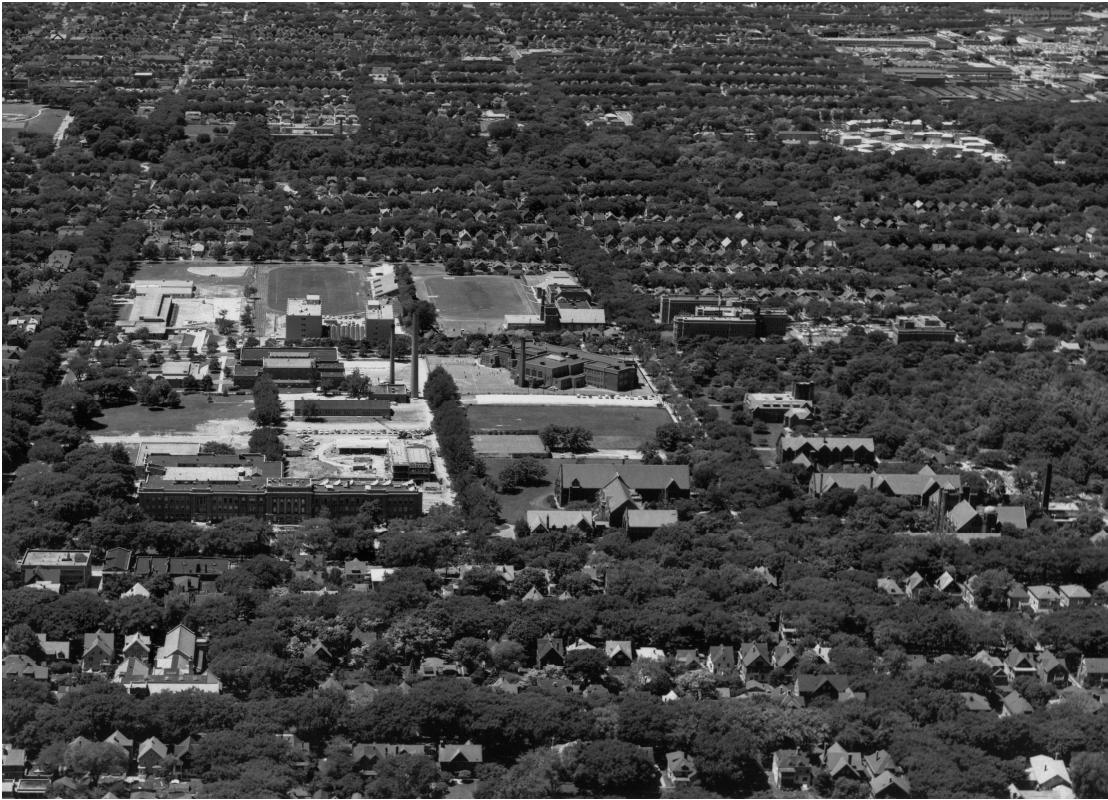
(Aerial photo looking east to west, 1956)