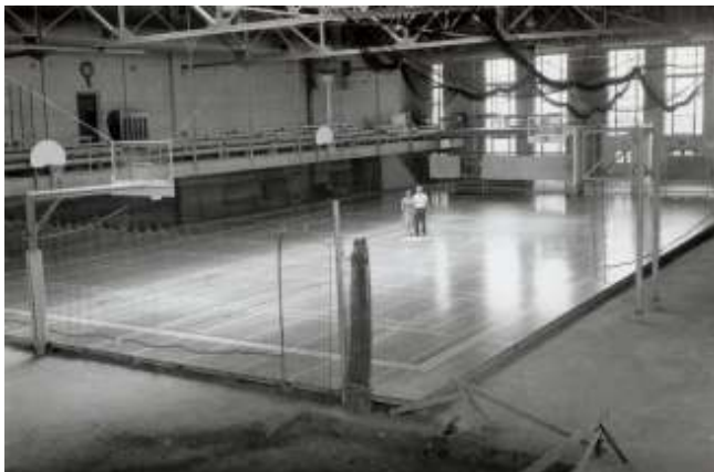
Baker Field House Main Gymnasium

Do you remember...when students registered for courses at the Field House? There were few buildings on campus in 1963. The Downer College buildings did not belong to UWM. What is now Mellencamp Hall served as the library. (A Madison student asked me: "Is that dinky building your library?") And, Curtin Hall and many others were still a dream. But we did have a Field House, and to it we took boxes containing as many cards as there were seats available in each course. The students came to the department table and picked up a card for the desired course - if there was one left - and finally presented their stack to make up their roster.