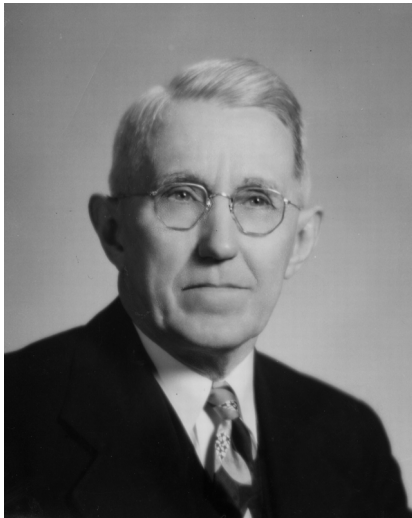
First President of UWM RFA (1962-1969)