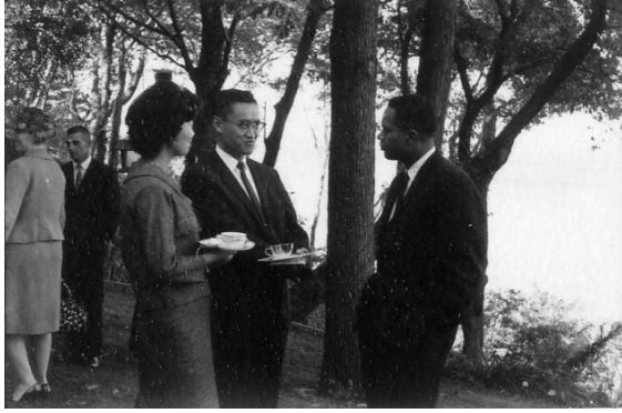
New Faculty "Social" - Chancellor's Residence