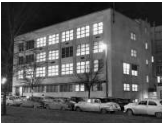
UWM Downtown Campus – South Hall

The Faculty “Dining Room” in the basement of the South Building (929 N. 6 th Street) was the headquarters of the “DLC” – Downtown Luncheon Club. The DLC was the hub of numerous “social events” on the Downtown UWM Campus. Among the more popular events was the annual birthday party honoring President Millard Fillmore, Christmas celebration with Santa, First Day of Spring observance, pre-wedding parties and new baby welcoming parties. Really, it was any excuse to have a party.