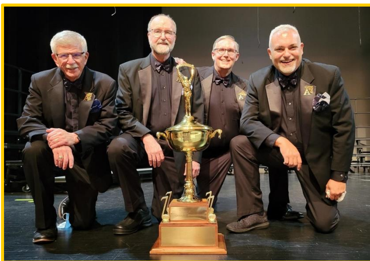
Abilene Paradox quartet, 2021 IL District senior champs & 9 th at Midwinter 2022.