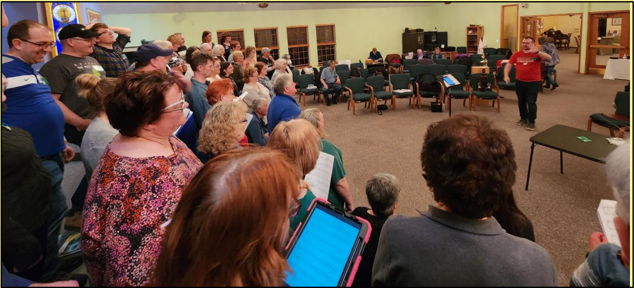
Forward Harmony Guest Night – Sunday, April 16, 2023

Guest night was a huge success at Forward Harmony at Emmanuel United Church of Christ (EUCC). Here are three photos from the big event.