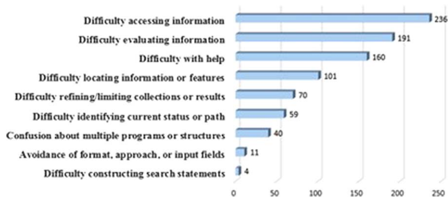
FIG. 5. Frequency of types of help-seeking situations. [Color figure can be viewed at wileyonlinelibrary.com]

mainly consist of Inadequate System and Domain Knowledge, whereas system sublevel factors are composed of Unclear Labeling, Complex Information Presentation, Unintuitive Features, Insufficient Feedback, and Lack of Contextual Information. In addition, Irrelevant or Confusing Results are the primary interaction sublevel factors. Task factors are not discussed because no significant correlations were found between task factors and situations.